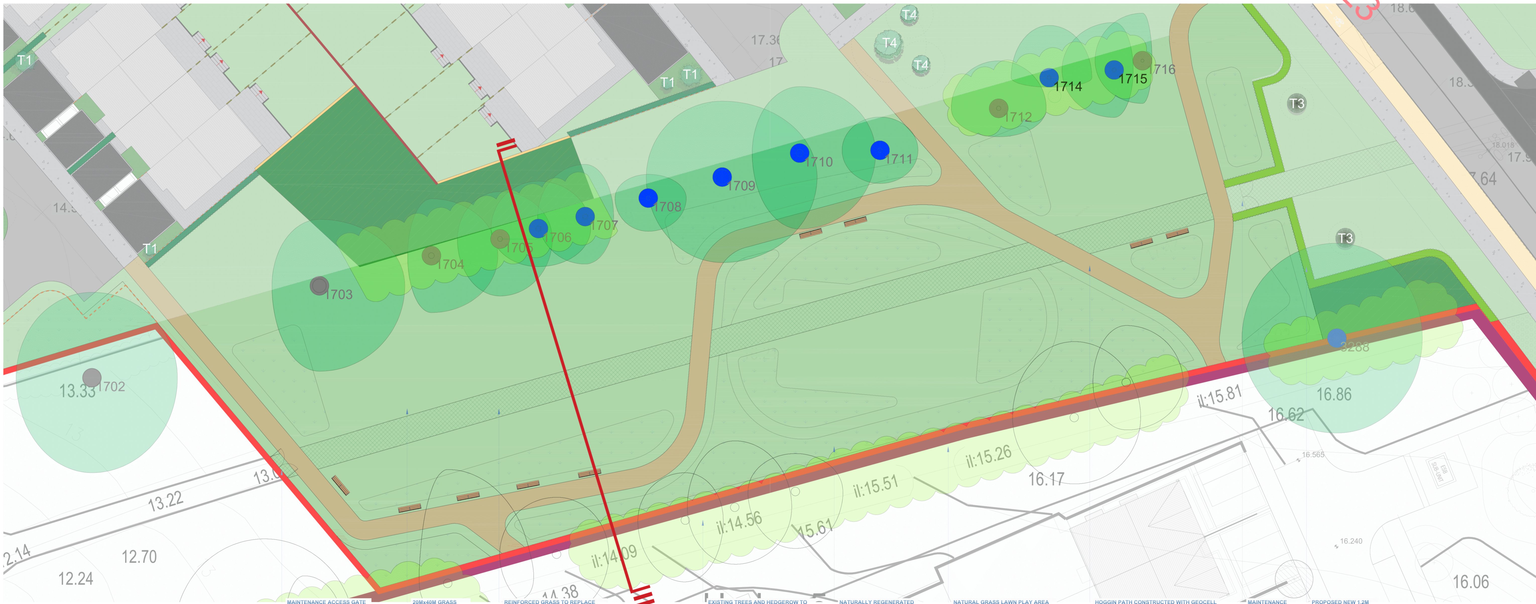
AVENUE PARK PLAN SCALE: 1:200/A1

DO NOT SCALE FROM THIS DRAWING. WORK ONLY FROM FIGURED DIMENSIONS. ALL ERRORS AND OMISSIONS ARE TO BE REPORTED TO LANDSCAPE ARCHITECT