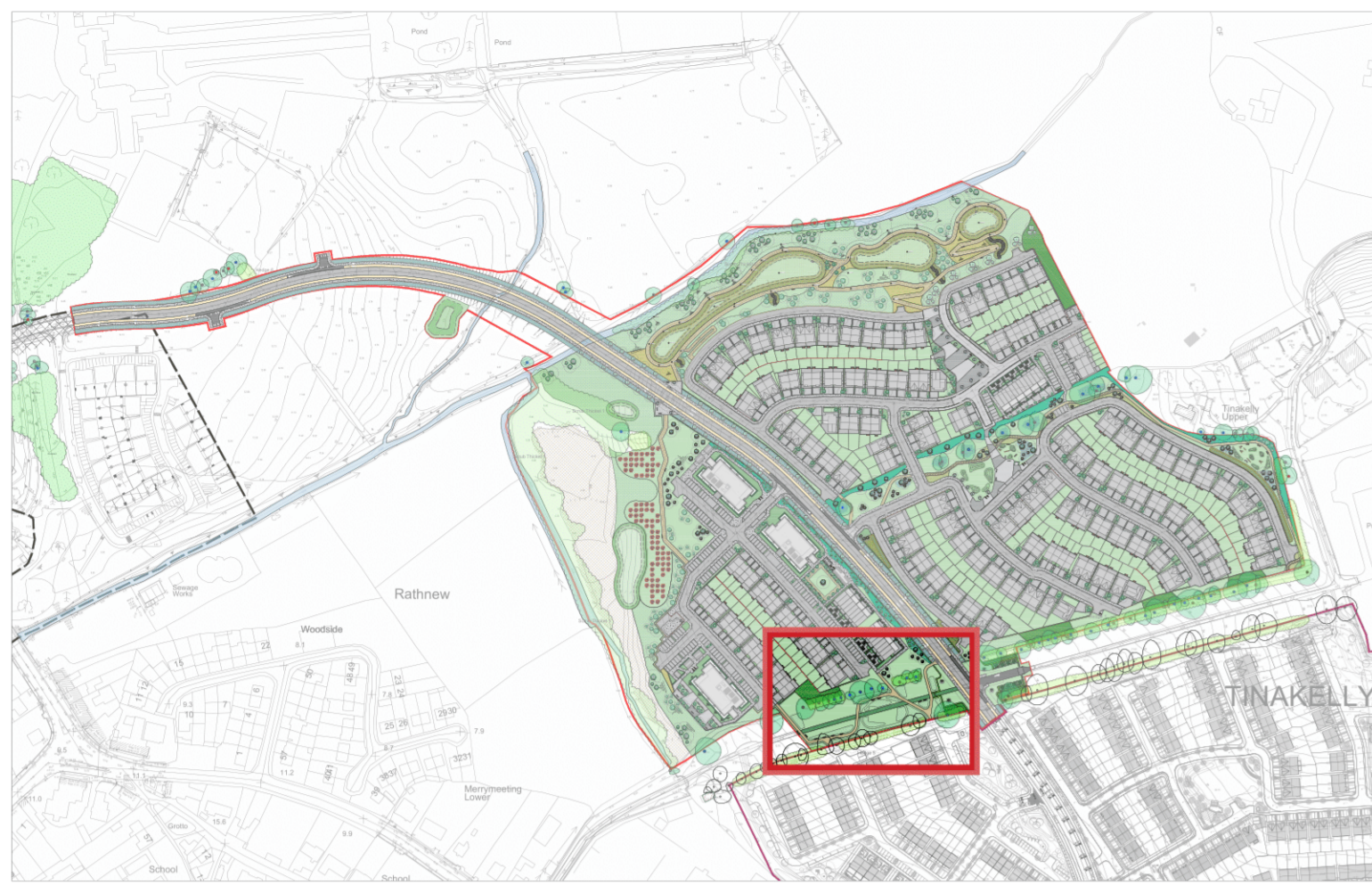
INDICATION PLAN SCALE: 1:5000/A1