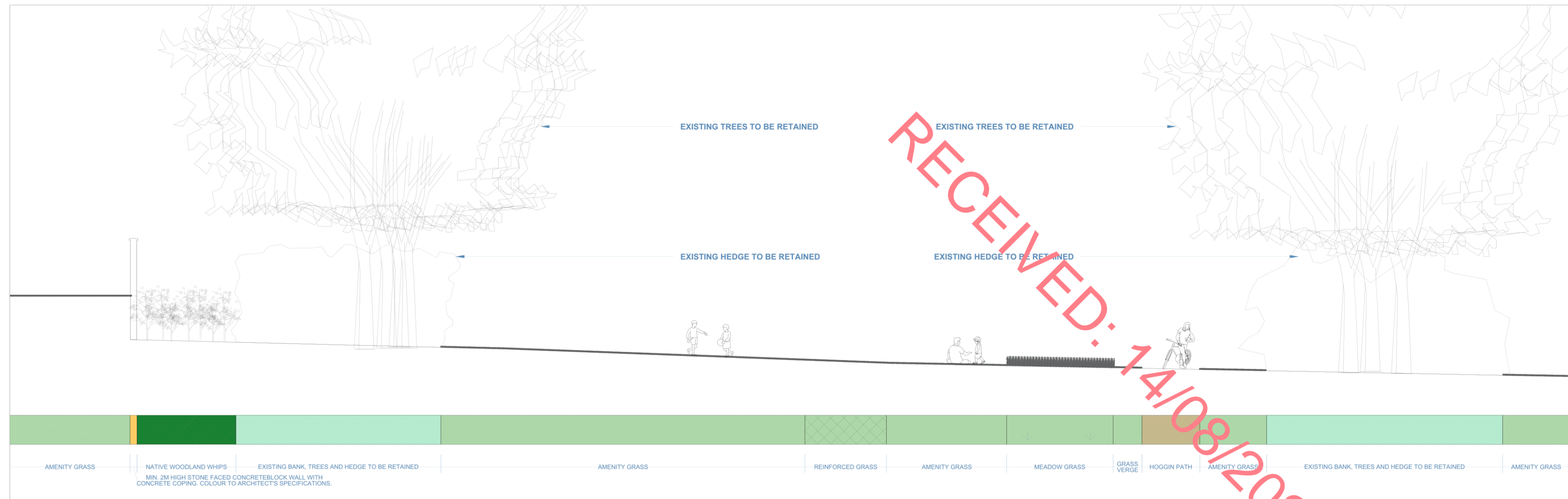
SECTION I-I SCALE: 1:100/A1